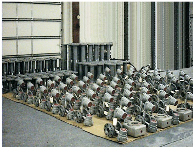
Meters before shipment.

Hoffer Flow Controls has been supplying turbine flowmeters for thirty years. Our expertise is in high performance flow measurement solutions. With