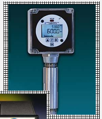
HIT-2A Rate Indicator / Totalizer (Refer to Technical Data Sheet HIT-2A-107)