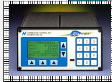
Nova-Flow Computer (Refer to Technical Data Sheet NF-102)